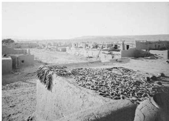
View of [Ohkay Owingeh] Pueblo and North Plaza," 1877.